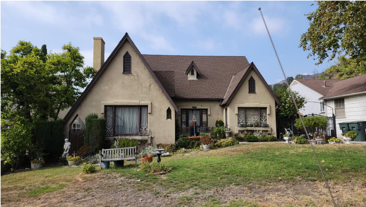
⑦ 1631 Vista Drive