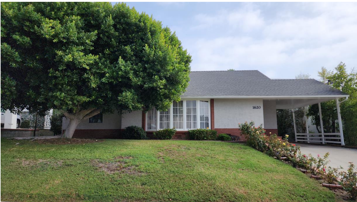
④ 1620 Vista Drive