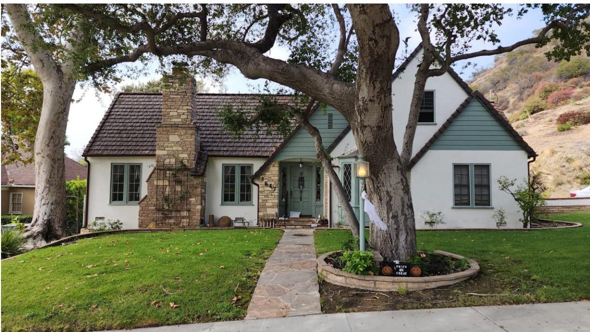
⑫ 1663 Vista Drive