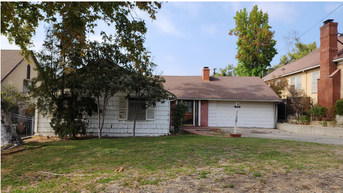
⑧ 1637 Vista Drive