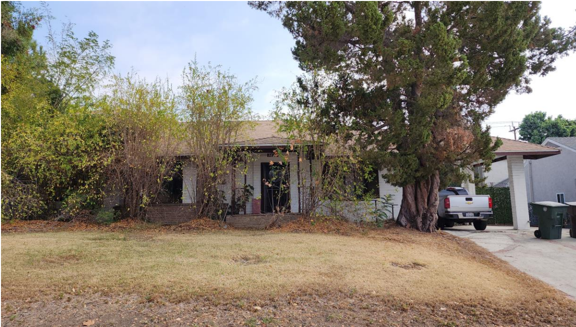
③ 1626 Vista Drive