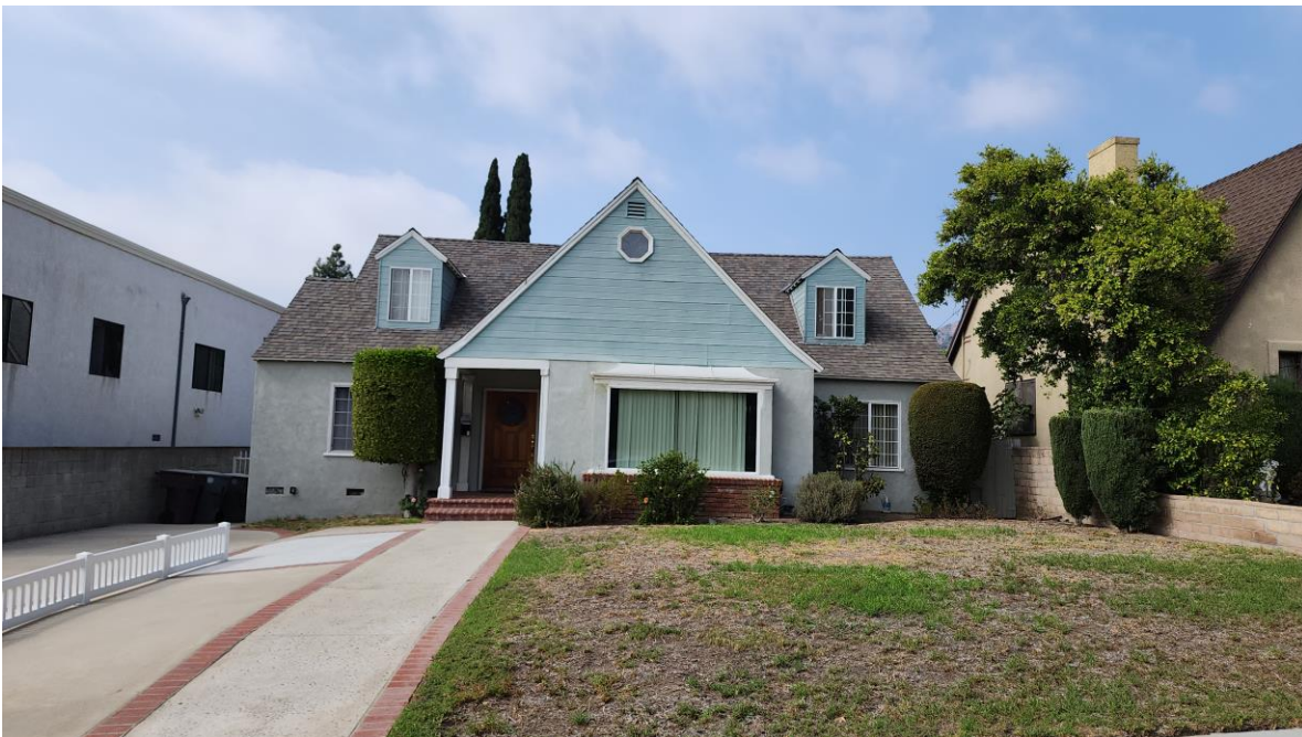
⑥ 1625 Vista Drive