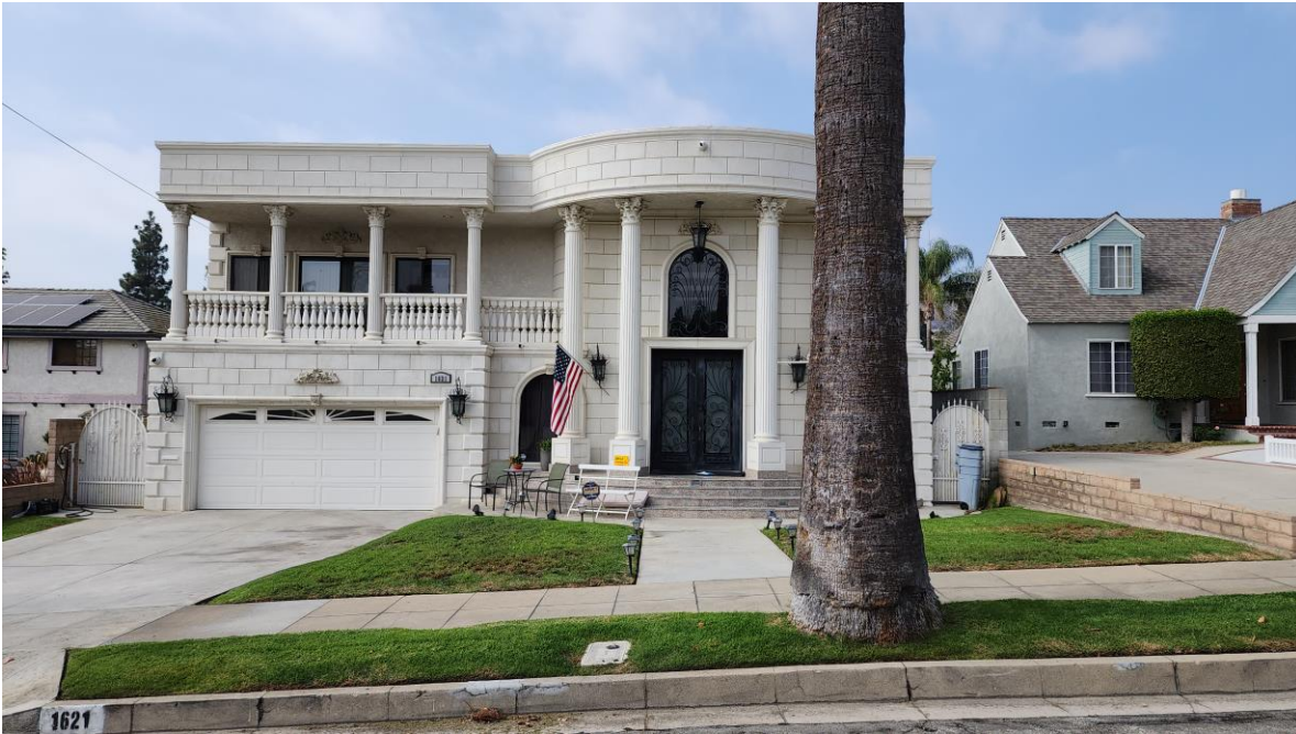
⑤ 1621 Vista Drive