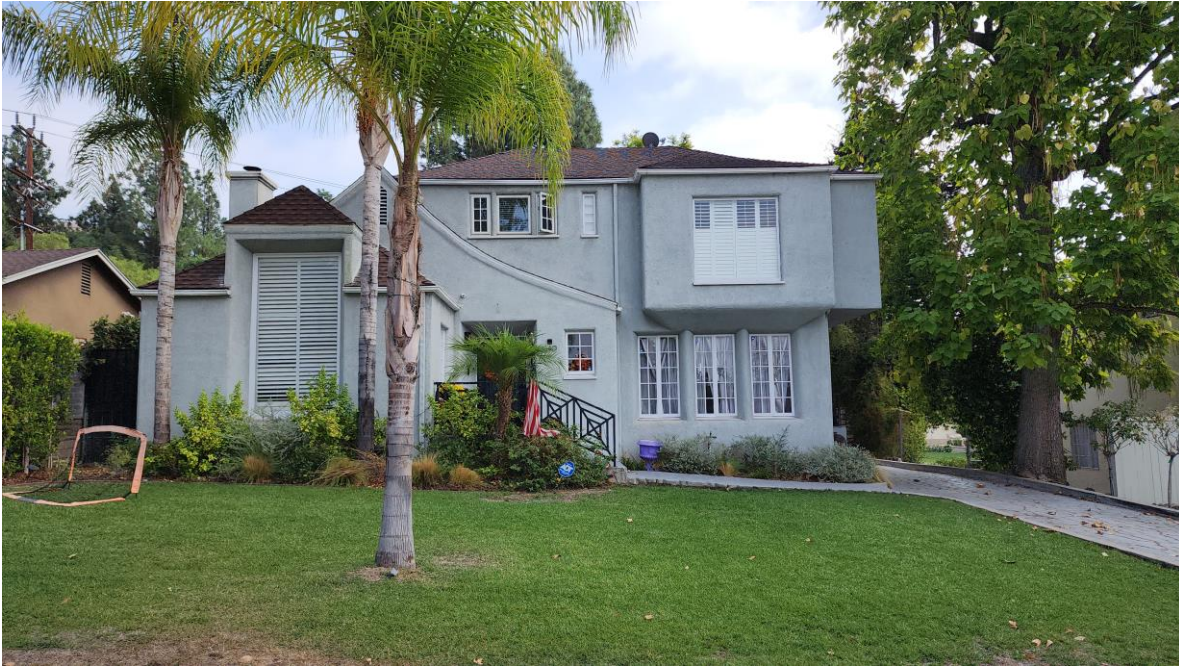
① 1640 Vista Drive