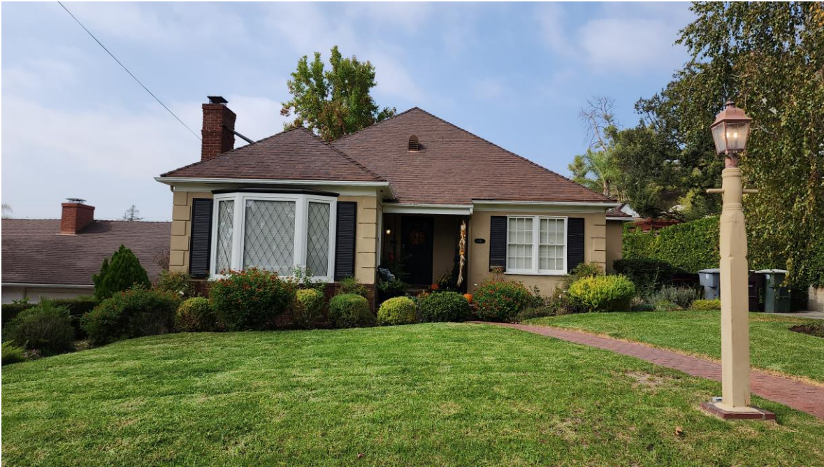
⑨ 1641 Vista Drive