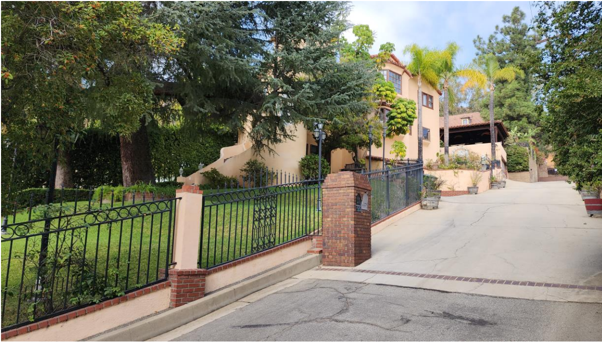
⑪ 1729 Foothill Drive