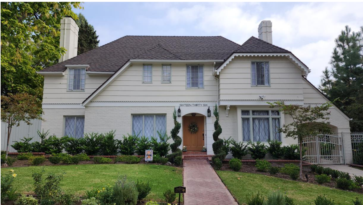
② 1636 Vista Drive